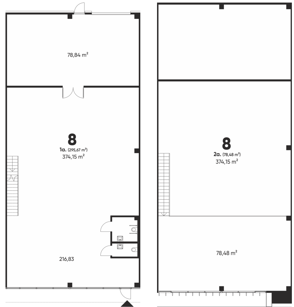
1st floor plan