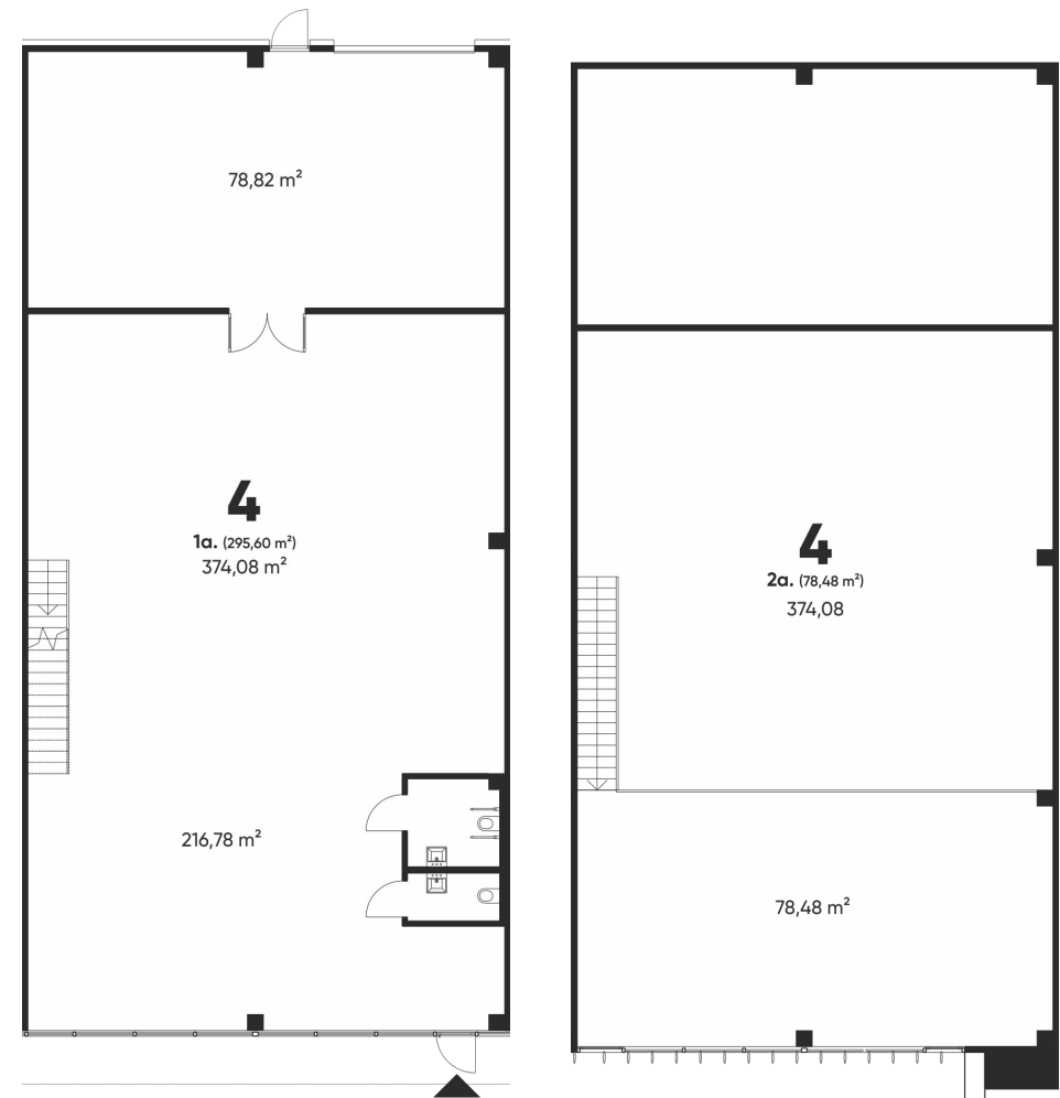
1st floor plan