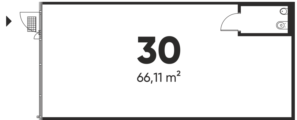
1st floor plan