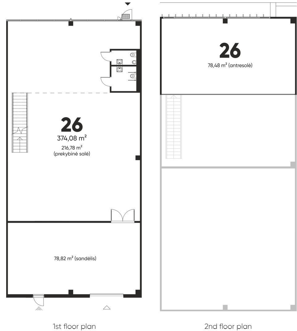
1st floor plan