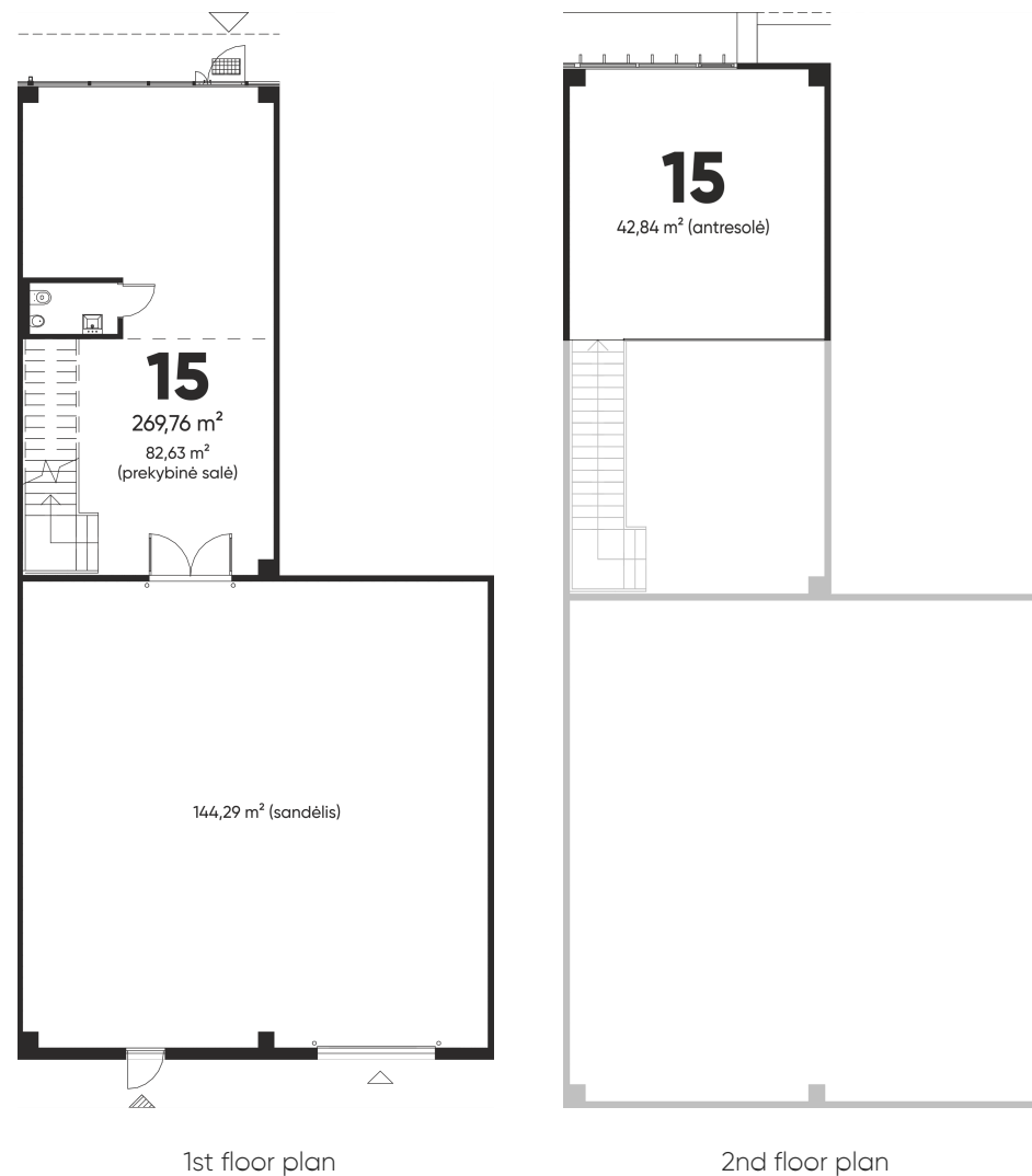
1st floor plan